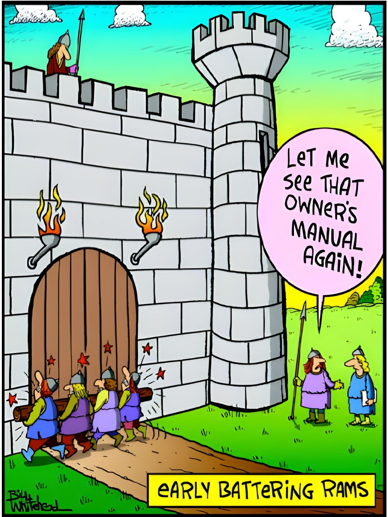
EARLY BATTERING RAMS